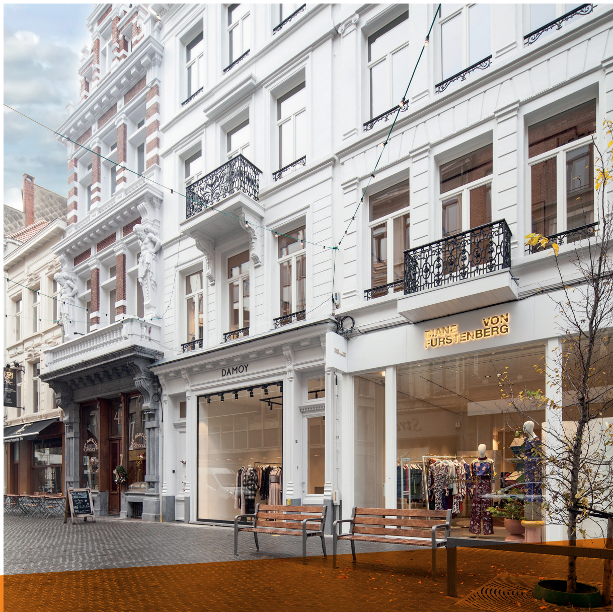
Antwerp - Steenhouwersvest 44-46-48